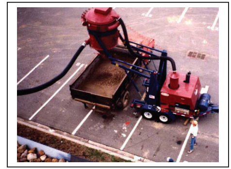
Model 624 over Dump Truck