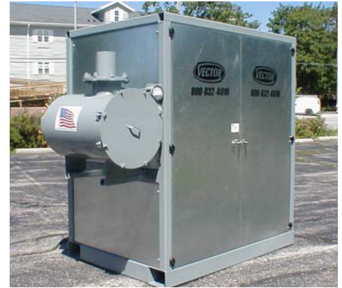
PM Series Power Module Model PM 2400/28, 170 Hp Shown (RB sound enclosure package)