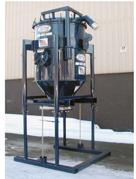
BH™ Series Cyclonic Baghouse Model BH 54" Shown With Manual Dump Valve