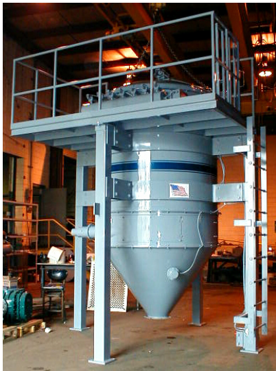
BH™ Series Cyclonic Baghouse Model BH 54" Shown With optional catwalk