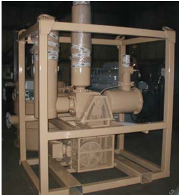
PM Series Power Module (Vertical) Model PM 2400/23, 75 Hp Shown (Shown with crane-lift package)

PM Series Vacuum Systems are versatile, skid-mounted industrial vacuums that combine two components; a skid mounted PM Power Module matched to a BH™ series cyclonic baghouse or alternative collection device. Components are directly connected through rigid and/or flexible pipe. Units can recover most flowable bulk materials and liquids for discharge directly back into the production system or into varied disposal or interim containers. Power modules are offered in electric or diesel power and can be utilized as vacuum producers for stand-alone vacuums or in paired to process equipment or to central piping. Sound levels of under 85 dBA are obtainable on many electric units by adding optional sound attenuation enclosures and premium grade silencers.