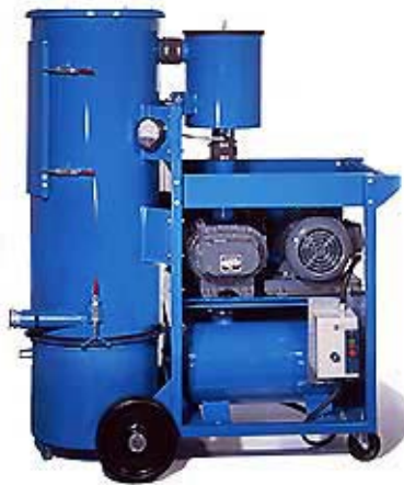
QVP Positive Displacement Series