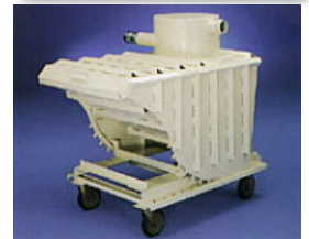
Add Drum Fillers, Storage Hoppers

Vector Technologies Ltd./ Vacuum Engineering Division/ Ross Cook Brand 6820 N. 43 rd Street/ Milwaukee WI USA 53209