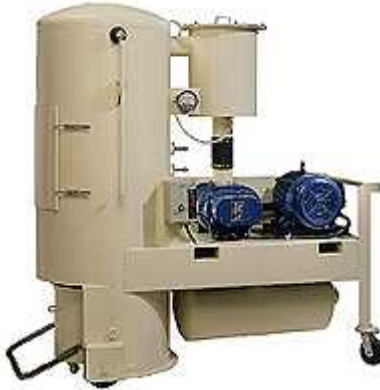
DV Positive Displacement Series