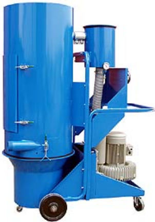
QVR Regenerative Series