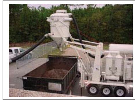
Model 721 with Optional Hi-Lift™