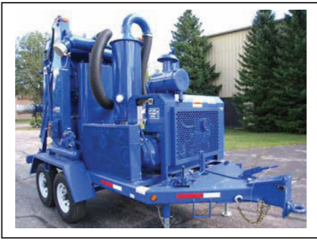
616 can be towed with a "One-Ton"