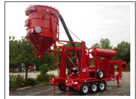
Model 6100HP with Optional Gooseneck